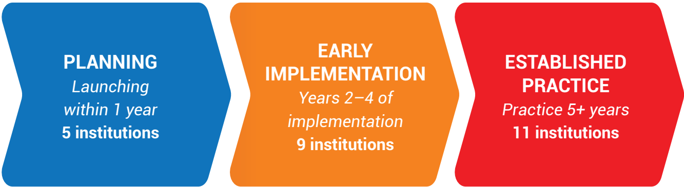
Figure 2. Institutions' Use of Predictive Analytics for Retention Initiatives

Planning. Five institutions indicated that they are in the planning phase and are preparing to launch their predictive analytics effort within the next year. Institutions in this phase are typically engaging in several core activities, including identifying the data variables that will be included in the predictive model, establishing a process for collecting and warehousing the data, and determining which personnel will be primarily responsible for analyzing the data and leading the development of interventions based on the results. All institutions in this phase reported having a cross-divisional planning group that is either specifically assigned to the predictive analytics effort or part of existing retention, advising, or enrollment management committees.