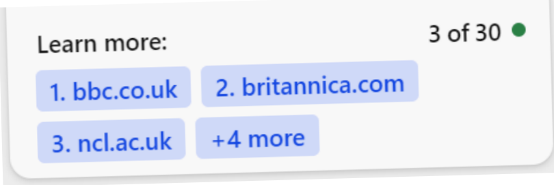
IMAGE CREATOR FROM DESIGNER

You can also explore additional details and dive deeper into a topic of interest as well as being able to access the original articles, studies, or reports to gain a more comprehensive understanding.