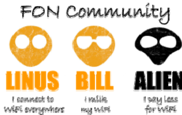
Figure 3: FON Business Model

experiment with new institutional models for access sharing. FON is a UK-registered startup with marquee venture capital funding and close to 80,000 registered users worldwide at the time of this writing. 34 Rather than build a mesh or in fact any new infrastructure, FON creates a community of registered “FONeros,” each of whom contributes their own broadband connection and wireless router, suitably configured with FON-provided software that enables users to function as either Linuses or Bills (Figure 3). Linuses elect to share their access, i.e. participate in a barter-based exchange with all other registered FONeros who come within range of their wireless router. Bills have the additional capability of providing paid access to Aliens , essentially non-FONeros who access FON routers using a “pre-paid” business model. FON then shares revenues from Aliens 50-50 with its Bills .