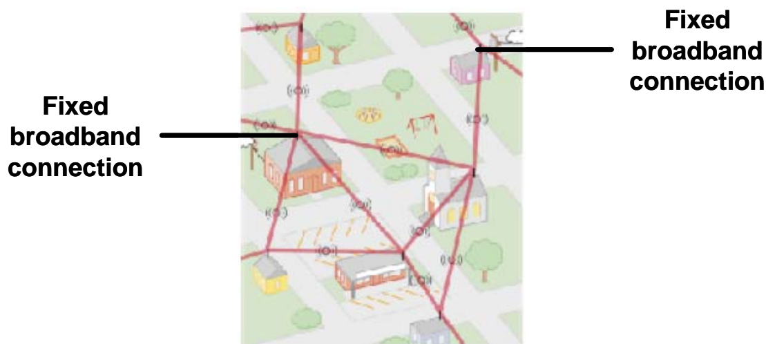
Figure 2: Wireless mesh network

Cooperative sharing on a larger scale – both geographic and among more people – requires more formalization of technical and/or institutional organizing principles. Examples of projects that address the technical dimension include CUWin and Roofnet, while FON (discussed further below) addresses the institutional dimension. 26 CUWin (originating in Urbana-Champaign, IL, home of the University of Illinois) and Roofnet (originating at MIT in Cambridge, MA) both involve experimental city-scale deployments of wireless mesh technologies that extend university research into the design and scalability of these networks. Both projects make their technology available as open source software, facilitating experimental deployments that are also taking place beyond their home communities. Roofnet has also engendered a commercial spinoff, Meraki Networks, aiming to produce very low-cost equipment suitable for end-users wishing to organize their own wireless mesh networks. 27