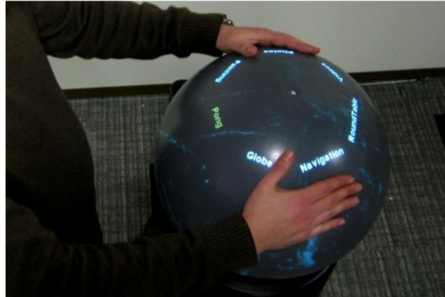
figure 3: Invoking a shared circular menu on top of Sphere using a bimanual orb-like invocation gesture.

egalitarian user experience, with each viewer around the display possessing an equally compelling perspective.