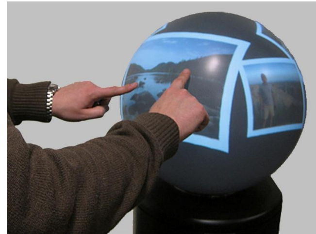
figure 1. Interacting on Sphere , our multi-touch spherical display prototype.

without any shadowing or occlusion problems. For more details on Sphere 's implementation, please refer to [1].