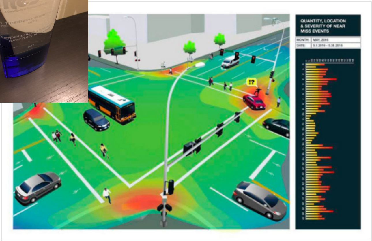
Video Analytics analyzes traffic camera video footage and uses near-miss collisions to predict where future crashes are likely to occur. Traffic engineers could then take corrective action to prevent them. File photo