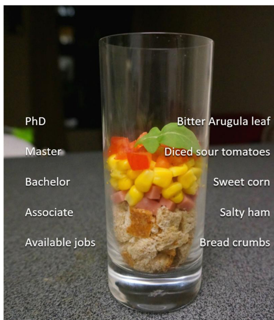
Figure 4. Salad cup to encode the number of annual STEM degree earners and STEM job openings. 24

(UX). Concepts such as joy of use, aesthetics, and hedonic qualities of interaction have become more important. The field has realized that experience is a key when designing technology for personal purposes (e.g., entertainment, social engagement, health tracking or even prayer). This shift is reflected in the professional make-up of the field; since the 2000s, a strong influx of designers has led to a new research focus on “interaction design.”