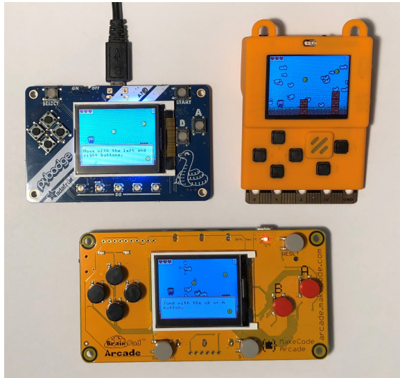
Figure 2. Three microcontroller-based game handhelds with 160x120 color screens. These boards use ARM’s Cortex-M4F core: the ATSAMD51G19 (192kB RAM, running at 120Mhz) and STM32F401RE (96kB RAM, running at 84Mhz).

host computer, but forego the benefits of advanced optimizing JIT compilers (such as V8) that require about two orders of magnitude more memory than is available on MCUs.