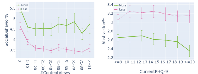
Figure 2: Mean percentage of words in ‘more’ and ‘less’ successful support messages that are associated with: SocialBehavior across each bin of the ContentViews context variable (left); and Abstraction across each bin of the CurrentPHQ-9 context variable (right).

Figure 2 (right) further shows how ‘more’ successful messages contained on average less words associated with the strategy variable Abstraction than ‘less’ successful messages; and this finding was consistent independent, e.g. , of the clients’ depressive symptoms prior to the supporter review ( cf. the bins of the CurrentPHQ-9 variable). Frequently used abstraction words were: think/thought, know, understand, and learn .