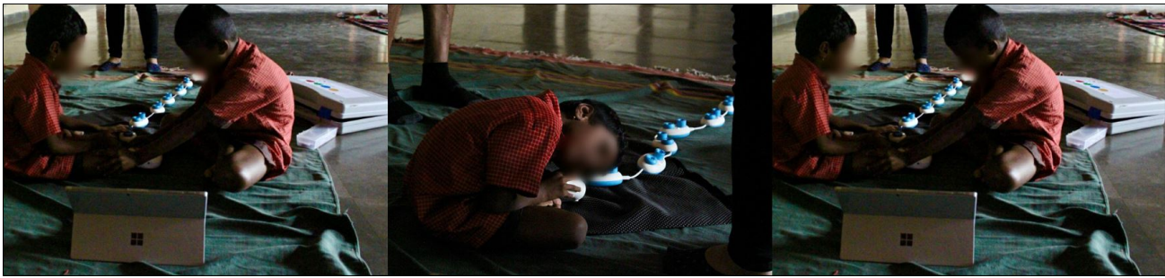
Figure 3: Children 'training' with Torino during play session in school.

non-sound pods while the only sound pods were the play pods. Children were usually uninterested in non-sound pods.