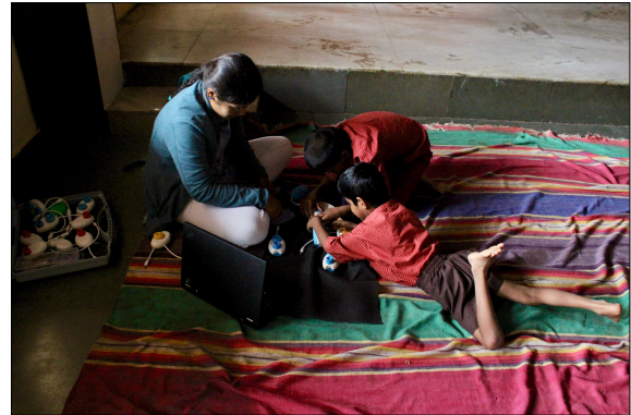
Figure 2: Children intensely at play

We find that children struggled and had frustrations with the devices as they didn't always work in ways expected, but also expressed joy at accidental discoveries that involved some stimulus such as sounds playing. In the Evaluation Section, we use the diary entries and observations to identify vignettes that convey the acquisition of the target skills during play.