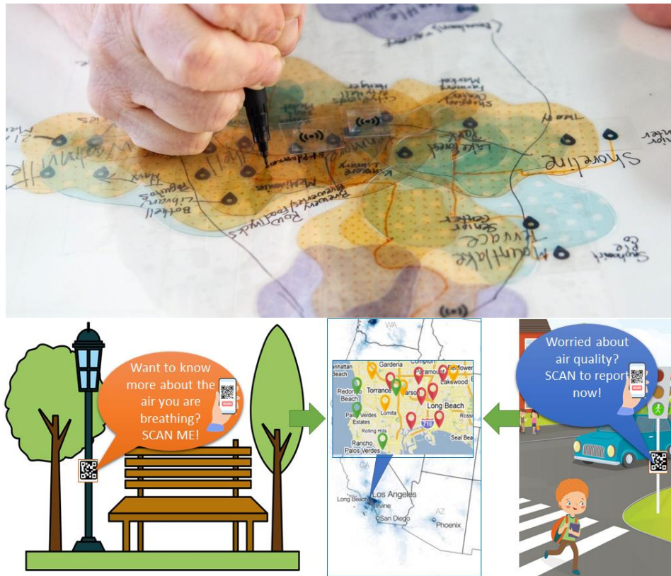
Figure 4. Workshop from Project Eclipse to study public perception of environment and air quality to create awareness based on objective measurements and subjective experiences [25] (Top). Creating community awareness and interactive participation: use simple technology like QR codes for citizens to learn about air quality and contribute to creating a city-wide Air Quality perception map (Bottom).

Policy/Planning → Pollution Sources → Emissions → Air Quality → Exposures → Health Outcomes