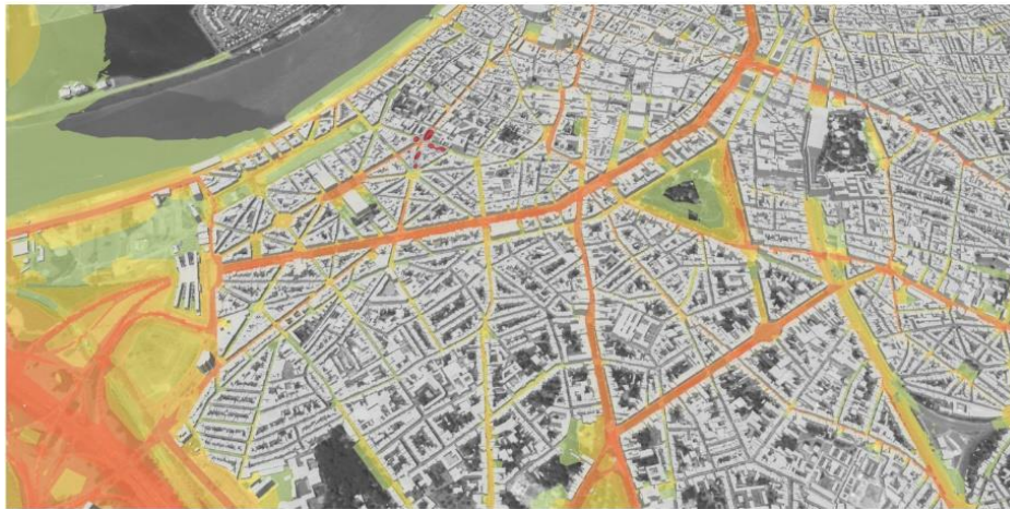
Figure 3. Screen capture from IMEC's website of fine-grained real-time air quality map that acts as a digital twin to support smart city policies.

While the responsibilities related to air quality policy, enforcement, education or advocacy varies from jurisdiction to jurisdiction, country to country, many stakeholders in the government, academia and non-profit sectors would benefit from the ability to get more information and insight regarding air quality. This is especially true when the enhanced air quality data can be analyzed with other data sets that could include health, social, economic, etc. to determine corollary or causal relationships. Examples of initiatives that have been funded by local governmental agencies that analyze air quality include IMEC's site for fine-grained real-time air quality monitoring (Figure 3) [22] and The Chicago Health Atlas [23] created by the CityTech Collaborative. These are examples of tools that enable users to analyze datasets related to specific areas related to air quality that can lead to actionable insights. Additional examples include the road use toll in UK and Singapore (plan for taxing detrimental activity and rewarding beneficial activity), and congestion pricing in Seattle [24].