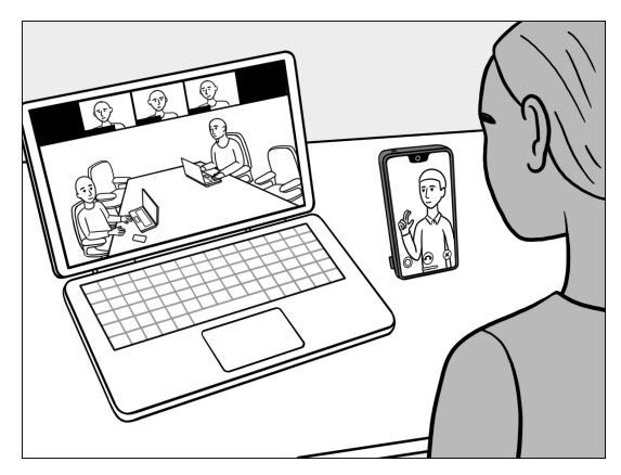
(a) Deaf ASL user attending a hybrid meeting remotely: the sign language interpreter interacts only with P21 on a separate external device, and is not a participant in the meeting itself