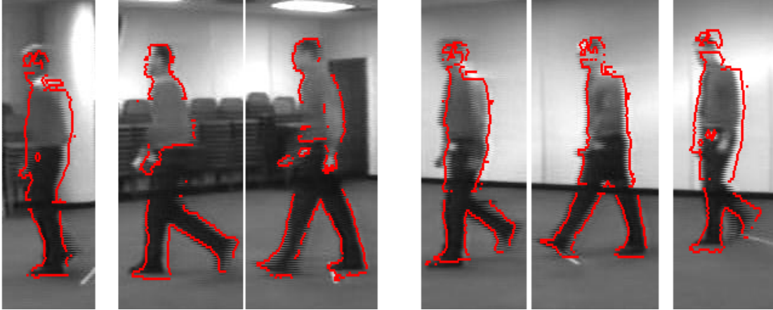
Figure 1. Cropped, sample frames from a tracked sequence. The overlays represent the maximum a posteriori exemplars. The person tracked appears in the training sequences.

One note on our terminology: The theory and algorithms presented were developed for true metrics. A function \rho is a metric when (1) \rho(a, b) \geq 0, \forall a, b , (2) \rho(a, b) = 0 iff a = b , (3) \rho(a, b) = \rho(b, a) , and (4) \rho(a, b) + \rho(b, c) \geq \rho(a, c) . The M^2 theory, however, applies also to certain functions without axioms (3) and (4). We will refer to these latter functions as “distance functions.”