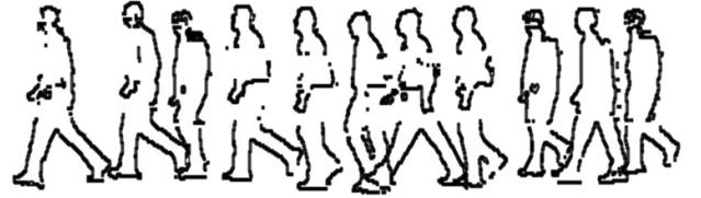
Figure 3. A randomly generated sequence using only learned dynamics. Edges shown represent the contours of model exemplars.

For the person tracking experiments, training and test sequences show various people walking from right to left in front of a stationary camera. The background in all of the training sequences is fixed, allowing us to use simple background subtraction and edge-detection routines to automatically generate the exemplars (naturally, we took advantage of the fixed background only for the purposes of generating exemplars – not for tracking). Examples of a handful of exemplars are shown in Figure 3. To the extent that topology fluctuates within a given mixture component, the linearity assumption of Section 3.1 is met only approximately.