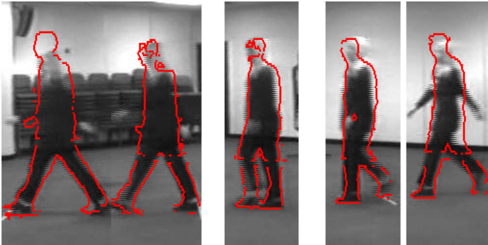
Figure 4. Cropped, sample frames from a tracked sequence. The person tracked does not appear in the training sequences.

partition functions. We tested the suitability of this assumption for the chamfer distance by conducting experiments on synthetically generated ellipses with up to 4 degrees of freedom. Results given in Figure 5 support the argument that d