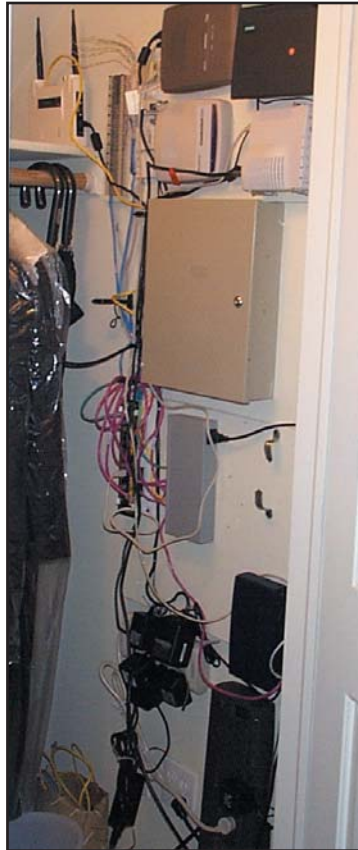
Figure 2. Home coat and wiring closet supporting: wired and wireless telephony, wired and wireless Ethernet, cable and DSL modems, battery backup, a firewall appliance, and patch panels.

The first reason inspiring the call for the Home Media Network is that integration of all media into a single digital networked system decreases complexity, cabling, and cost. The second reason is to make all I/O devices multipurpose and general. Think of word processor hardware, which has been displaced by the PC: it made the most sense to make the I/O