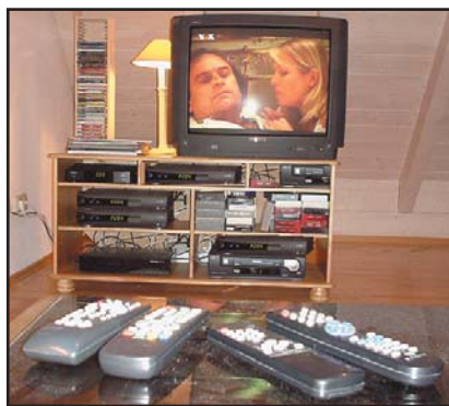
Figure 1. Remote controls and bird's-nest cabling demonstrate the lack of integration in simple home componentized A/V systems.

and noisy, making them unwelcome in the living room. Also, the benefit of a PC's flexibility and extensibility comes at the price of complexity, making their management and maintenance almost as difficult as