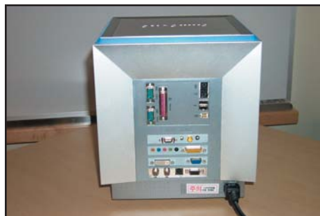
Figure 5. Rear view of prototype Mbox to interface with CATV, Ethernet, and various A/V sources.

Speculation abounds regarding the future of electronic media delivery that is not carried by a physical medium (like CD or DVD). Users of PVRs such as TiVo and UltimateTV have indicated they almost always time-shift TV viewing, playing video from their personal cache at their convenience, rather than watching it at the scheduled time—so-called