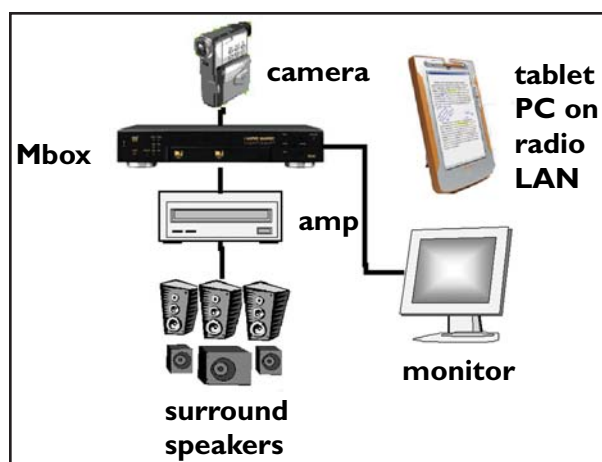
Figure 4. The “Mbox” is a digital home entertainment center with radio and TV tuners, CD, DVD, and PVR, which simplifies the arrangement and adds functionality. Legacy media such as audiocassettes and vinyl records would be reproduced in a digital format. All component cables and separate remotes are eliminated. Later-generation systems will replace amplifier and speakers with powered IP speakers.

EVENTUALLY, ALL MEDIA DEVICES WILL be digital and attached to an IP network. However, we foresee a very long interim that includes legacy analog. To cope with the transition, each legacy analog device (for example, receiver or TV set) will be driven by a digital transformer that connects it to the digital network. As an