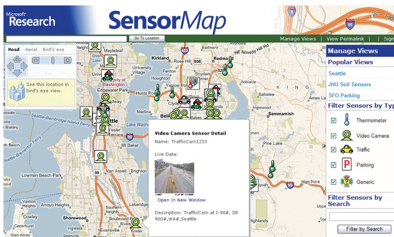
Figure 2. The SensorMap application user interface.

Zhao discussed the specialized methods to help design the mobile proxy. 2