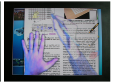
Figure 7. Our high precision algorithm allows seemless multi-touch interactions with an ordinary tablet display. ( left ) zooming into a map using a bimanual gesture ( centre ) using the non-dominant hand to rotate an electronic canvas while drawing with the stylus, and ( right ) a remote user zooms into a figure and highlights text in a collaborative work scenario where the workspace is shared multiple tablets. The stereo camera is used to render a remote user's hands on the tablet with depth-sensitive transparency; we call this phantom presence [8].

the mis-classifications and individual finger tips are detected with almost 100% accuracy. For learning the touch-detection classifier, we define a finger tip that is roughly 2mm or more from the surface as non-touching. Figure 6 shows the accuracy of our touch-detection algorithm. Using the method described in section 3.3, detected fingertips were correctly classified as touching or not with an accuracy of 98.48%. As a benchmark, the table also shows the performance of a classifier than uses an alternate set of features based on simple disparity estimates from each fingertip as opposed to the geometric model of section 3.3.