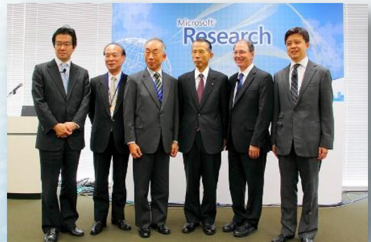
Mt. Fuji Plan – Press Announcement