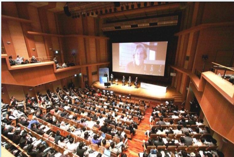
Nov. 4, 2009 at Keio University

Launched Mt. Fuji Plan announcing a $3M investment over three years