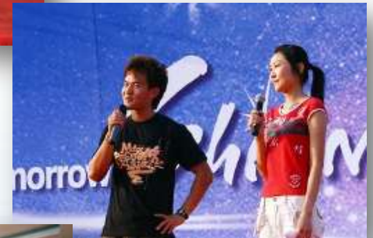
Show Their Full Potential