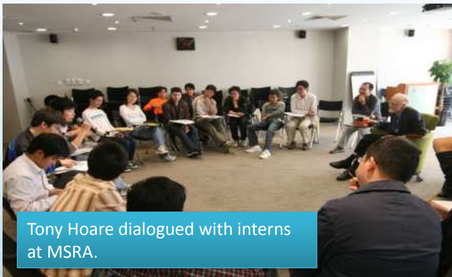
Tony Hoare dialogued with interns at MSRA.