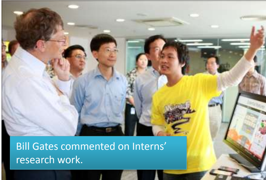
Bill Gates commented on Interns' research work.