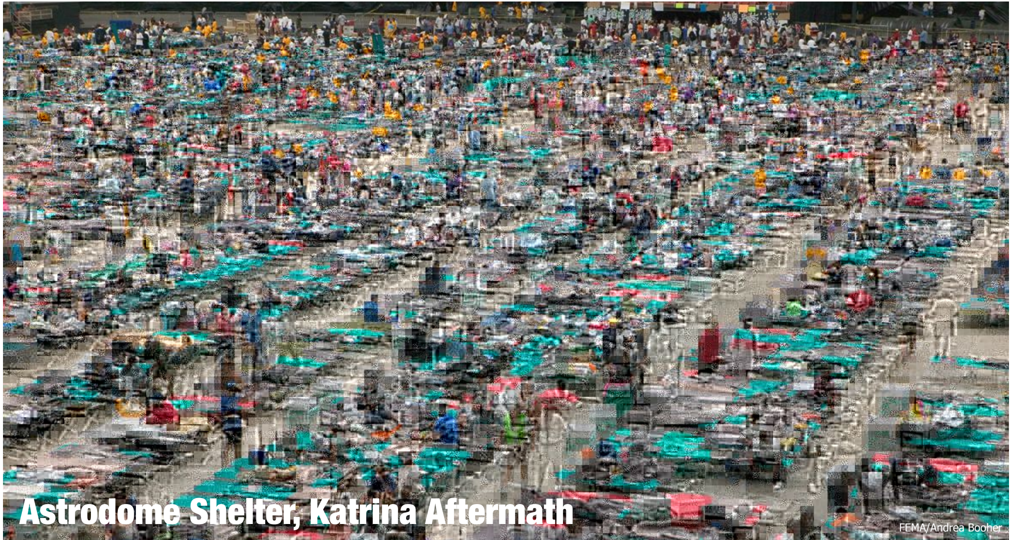
Astrodome Shelter, Katrina Aftermath