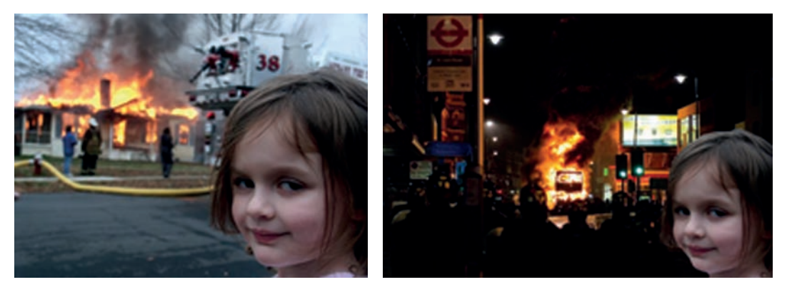
Figure 9: Disaster Girl original and crisis meme example.