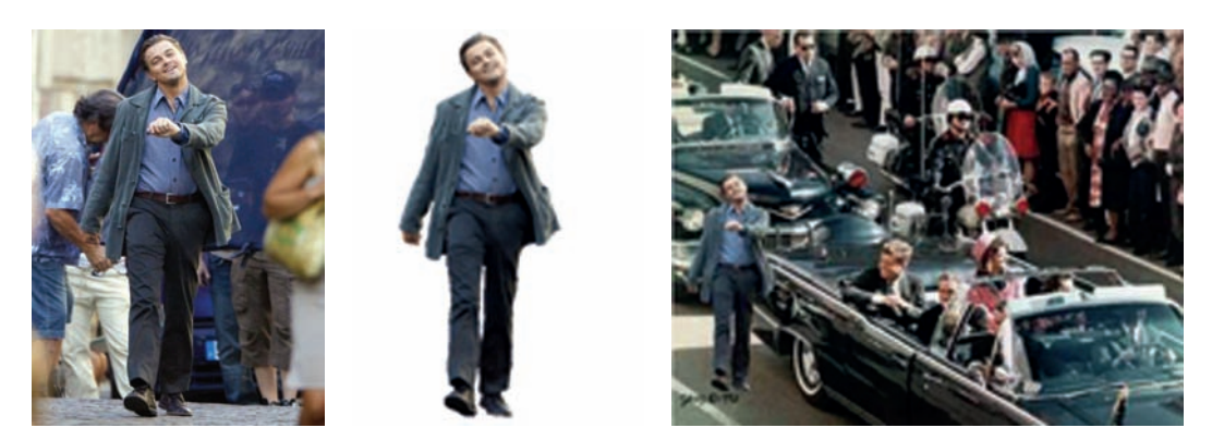
Figure 8: Strutting Leo original, exploitable and crisis meme example.