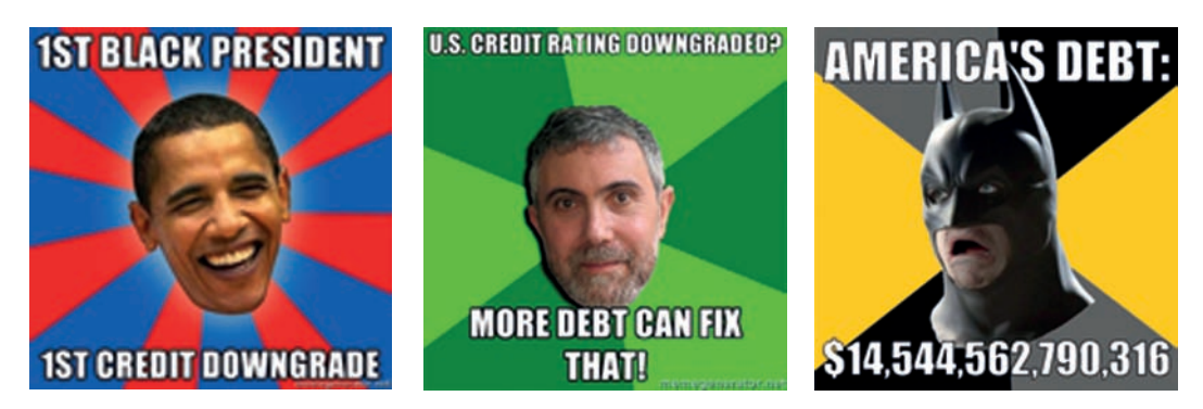
Figure 7: Advice Animals crisis memes.

(Figure 7, left), economist Paul Krugman (Figure 7, middle) and even Batman (right) were used to critique the left-wing position.