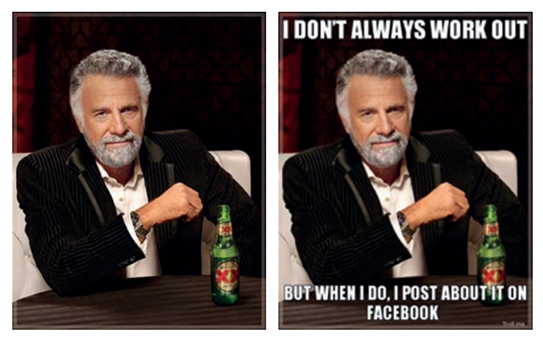
Figure 4: The Most Interesting Man in the World original and meme example.

The original version is an image macro snowclone based on the Dos Equis beer brand advertising campaign centering on 'The Most Interesting Man in the World' (Know Your Meme 2011f). The man (Figure 4, left) illustrated male power as cool, self-satisfied and defiant of societal norms. The man's exploits are so epic in scale that his choice of beer is epic by association (I don't always drink beer, but when I do it's Dos Equis). Although the campaign nominally rests on the audience recognizing the man's power, the audience is also supposed to take an ironic position towards the man: he is impossibly powerful and hence as much a figure of ridicule as respect. In the meme version (Figure 4, right), the notion of power is conveyed through the image of either the man himself or any figure that can be easily depicted through midshot image. This is combined with a snowclone version of the campaign's tag line: 'I don't always <verb phrase1>, but when I do, <verb phrase2>' with the phrases positioned as setup at the top and punch line at the bottom. However, the meme version usually emphasizes the original campaign's ironic position by using the punch line to show the figure as ridiculous.