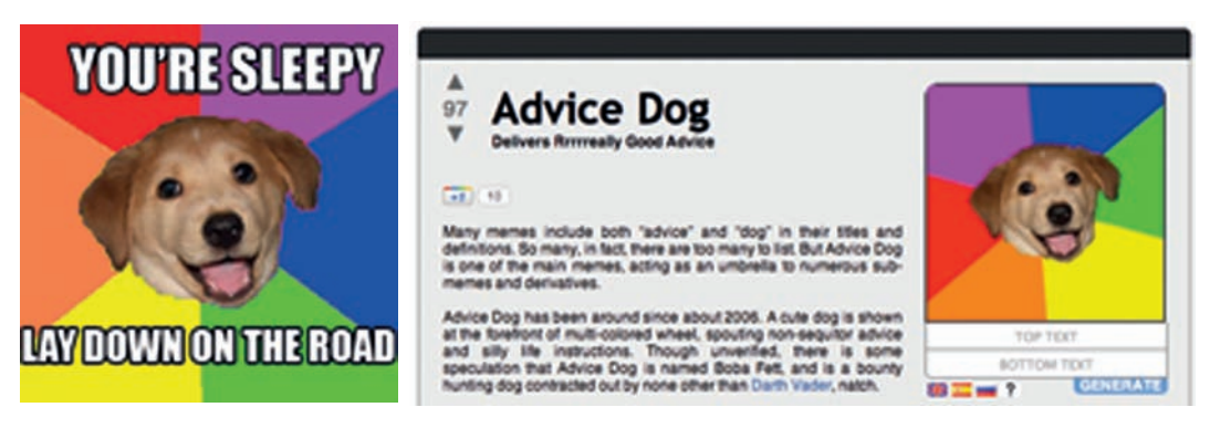
Figure 6: Original (Bad) Advice Dog and Meme Generator.

The Most Interesting Man in the World meme is part of a wider category of memes called Advice Animals, which are image macros featuring animals or humans and superimposed text purporting to represent a character trait or archetype (Know Your Meme 2011b). The original meme, naming the category, was Advice Dog (Figure 6, left). However, while The Most Interesting Man in the World uses an unedited whole photograph, most Advice Animals follow the distinct visual formula of superimposing just the animal/person head on a colour-wheel background. The originator of any given Advice Animal sets the image and colour-wheel and the rest of the series only add new text based on the theme. Advice Animals are visually and thematically coherent within and across series. One of the reasons Advice Animals have become so prevalent is that sites such as Meme Generator (Figure 6, right) provide all the artwork and tools required to create new instances of existing memes and even help create new series, such as Advice Animal crisis memes. During the recent US debt crisis, Advice Animals based on Barack Obama