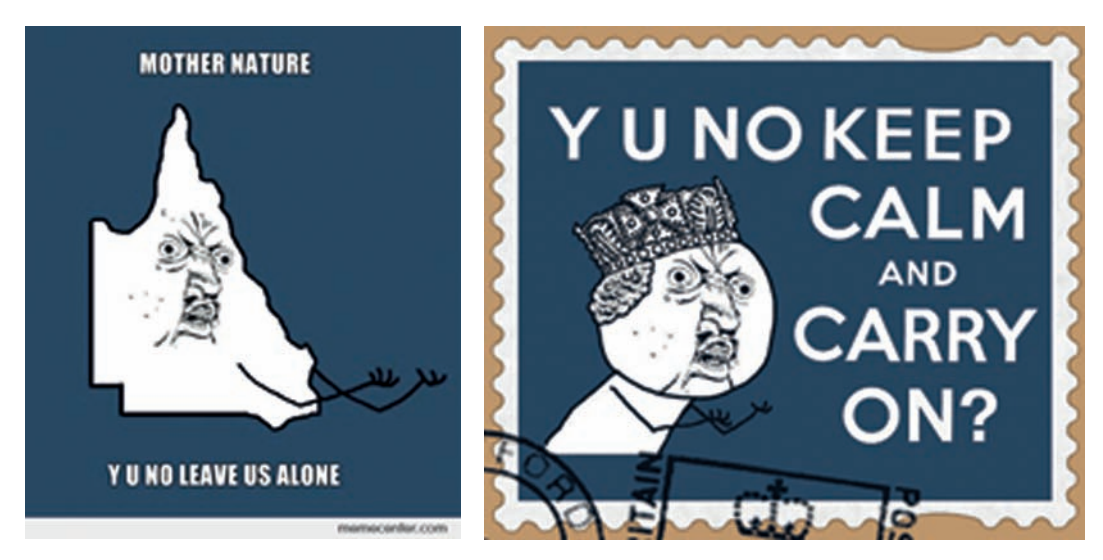
Figure 12: Y U No crisis meme examples.

imprecation for the rioting from the perspective of those (within or outside) who hold a particular stereotypical viewpoint of British society as typified by calm and the 'stiff upper lip' sentiment.