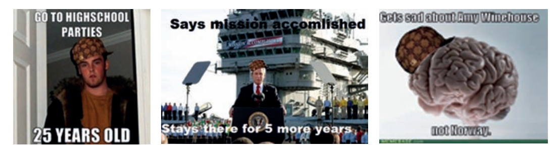
Figure 14: Scumbag Steve original meme example, crisis meme example and reflexive crisis meme example.

The moral dimension of this Scumbag Brain example also brings up the issue that different sites of meme production have very different standards as to what is considered acceptable. Know Your Meme pages on individual memes frequently mention 4Chan in early origin reports e.g. Chubby Bubbles Girl. 4Chan was designed to be an anonymous image-sharing forum in which users could post without restriction. Users in the/b/forum are notorious for their resistance to traditional morality (Knuttila 2011), this, combined with a