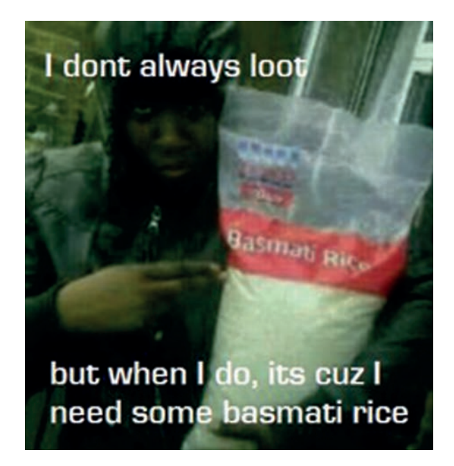
Figure 1: UK riots crisis meme.

Similar posts can be found for several recent crises, ranging from natural disasters (the Queensland floods), policy crises (the US debt crisis), terrorism (Norwegian mass killings), through to celebrity deaths (Amy Winehouse). Even given the large number of potentially creative people in the world, just how is that such posts are so readily produced? The answer, of course, is that most are not created from whole cloth. Rather, they are image macros, which are one form of online memes: thematically and formally replicated trends in online behaviour. Michele Knobel and Colin Lankshear's detailed thematic analysis of nineteen classic online memes finds that one of the overarching purposes of online memes is social commentary (2007: 218) within which they find three subcategories: people concerned with displays of good citizenship; tongue-in-cheek, socially oriented, political critique; and social activism or advocacy. Posts such as Figure 1 combine elements of all three of these sub-categories. In this article I will refer to them collectively as crisis memes. Although crisis memes could take forms other than image macros (such as videos, animated gifs, twitter hashtags), judging by meme collection sites such as Know Your Meme, the image macro form is the most visible. As such, this article will focus exclusively on the underpinnings, development,