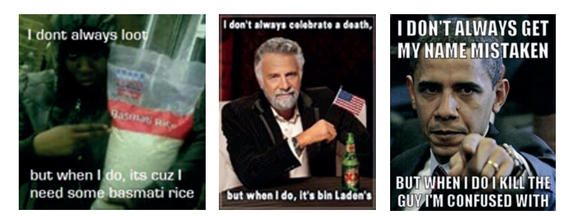
Figure 5: The Most Interesting Man in the World crisis memes.

version contains both right-wing and left-wing critiques. By playing up the issue of the US political right harping on the coincidental similarity of his name to that of Osama Bin Laden, the image paints his hardcore action as petty. But it also takes a left-wing perspective, painting action that might be desirable to the right as a potentially unconscionable over-reach of power.