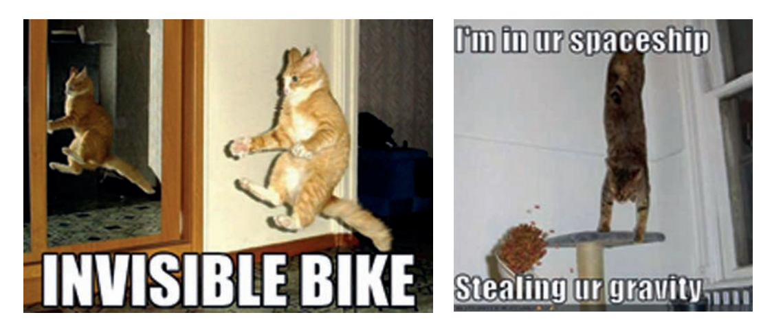
Figure 3: LOLcat snowclones.

Happy Cat also set a standard for an idiomatic pidgin that has come to be referred to as 'LOLspeak' with remarkably robust rules (Dash 2007). Historically, language play has been a staple of typographic Internet communication (Crystal 2001), and this heightened sensitivity to play with language patterns is particularly important to meme development. Apart from image macros, the other fundamental building block of online memes is the language template termed 'snowclones' (Know Your Meme 2011l). Unlike LOLspeak, which is based around particular grammatical patterns with some common content themes, snowclones are more direct verbal templates.