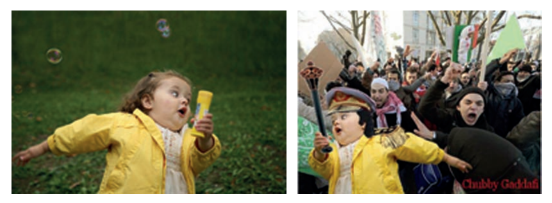
Figure 10: Chubby Bubbles Girl original and crisis meme example.