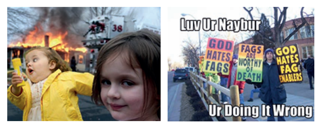
Figure 13: Disaster Girl and Chubby Bubbles Girl; LOLspeak and You're Doing It Wrong.

As well as their own direct and fairly simple meaning, memes draw representational power from their association with one another. For example, when a new exploitable appears, it is common to find it combined with other exploitables with similar themes such as the combination of Disaster Girl and Chubby Bubbles Girl (figure 13, left). Similarly, a striking photograph can be used in conjunction with several verbal memes, as in the combination of LOLspeak with the 'You're doing it wrong' meme superimposed over the image of homophobic Westboro Baptist Church protestors (Figure 13, right).