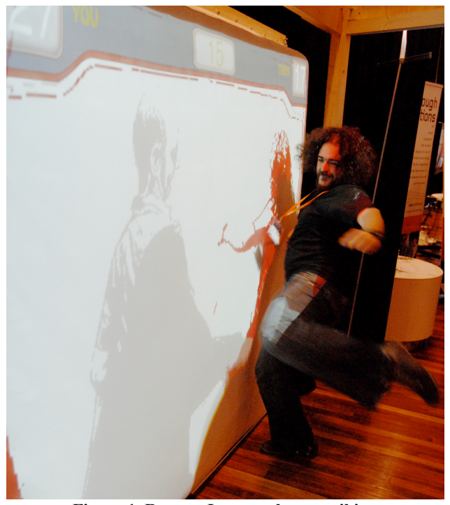
Figure 1. Remote Impact player striking

Playstation Move increasingly support such multi-player co-located exertion play, yet many games are not utilizing mediated body-to-body interactions. By body-to-body interactions we mean interactions in which bodies act on and react to each other, going beyond touch interactions (as often explored in HCI in an arts context, for example see [9]). Many current commercial games support mostly independent activities, where players take turns or play in parallel [26] (e.g., games oriented on aerobics, golf, jogging, yoga). These activities contrast with traditional sports, which often feature extensive body-to-body interactions, as in boxing, American football and rugby. If console games have attempted to lean on these body-tobody interactions (for example the Madden series), they restrict bodily interactions to avatars, and fall short when it comes to body-to-body interactions between players. The limitations of sensing and actuating technologies to support such body-to-body interactions may be part of the reason: for example, the underlying sensor technologies in the