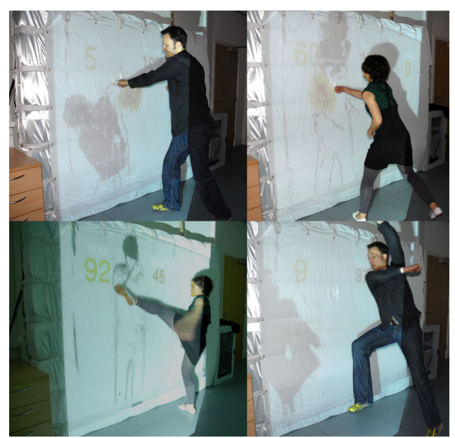
Figure 2. Combat actions with Remote Impact

Once the game starts, both players try to strike each other's shadow. They can target any area of their opponent's shadow, and strike with their palms, fists, feet or entire body (Fig. 2). An impact on the remote person's shadow area is considered a successful hit. The impact of the user's body onto the surface is measured by detecting the deformation of the surface area. The higher the intensity of the hit, the higher the points scored. If a hit is placed within the shadow area of the remote person, a visual indicator is displayed on the impact spot and a sound effect is played to indicate to both players that a successful hit occurred. If the player missed, a different visual appears, indicating that no points were added to the score. The player with the most points within the time limit wins the game.