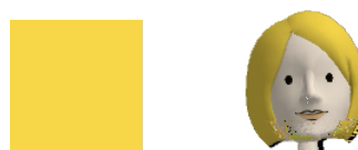
Figure 1: Example of MTurk Task 2. Task 1 is the same except that only a swatch is given.

The design that we suggested has a minor limitation in that a color swatch may display differently on different monitors. However, we hope to overcome this issue by collecting 50 annotations per RGB value. The example color \xrightarrow{e} emotion \xrightarrow{c} concept associations produced by different annotators a_i are shown below: