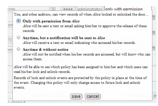
Figure 3. Options for configuring each user's auditing privacy.