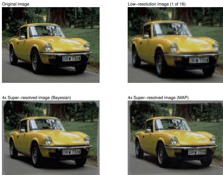
Figure 1: Example using synthetically generated data showing ( top left ) the original image, ( top right ) an example low resolution image and ( bottom left ) the inferred super-resolved image. Also shown, in ( bottom right ), is a comparison super-resolved image obtained by joint optimization with respect to the super-resolved image and the parameters, demonstrating the significantly poorer result.

In Figure 1(a) we show the original image, together with an example low resolution image in Figure 1(b). Figure 1(c) shows the super-resolved image obtained using our Bayesian approach. We see that the super-resolved image is of dramatically better quality than the low resolution images from which it is inferred. The converged value for the PSF width parameter is \gamma = 1.94 , close to the true value 2.0.