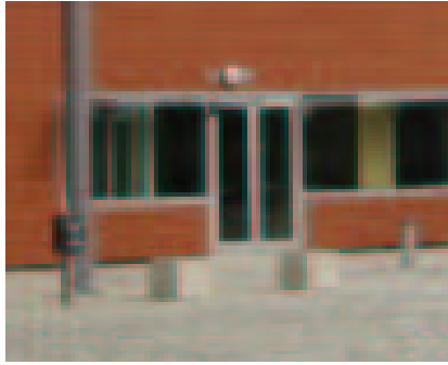
(a) Low-resolution image (1 of 16)