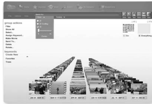
Figure 3: The Time Cluster view. Objects are grouped together by their proximity to one another in time.

by that cluster. Clicking on a label selects all of the objects in its cluster. You can roll your mouse over any object, and it will show a large image or play the video, as always