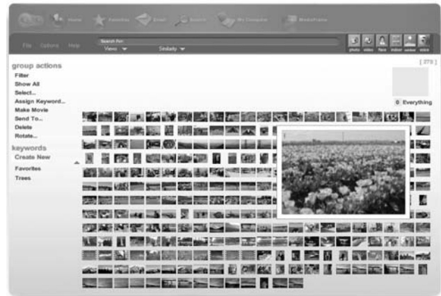
Figure 1: MediaBrowser immediately after starting up with a fresh set of media objects. The user has the cursor hovering over the picture of flowers so it is enlarged.

throughout the system since they can help users maintain context when using the system [12]. Our goal in this project was to create a single application that brings together a variety of recent UI and image analysis advances in a single consistent, visually attractive, and easy to use application for applying labels to image and video files meaningful to the user. Such an application must be sufficiently pleasant to use that it lowers the bar on the daunting task of organizing hundreds or even thousands of media objects.