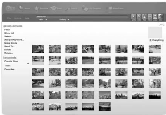
Figure 2b: After smooth and automatic rearrangement.