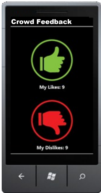
Figure 1. The Crowd Feedback mobile client.