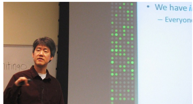
Figure 3. Crowd Feedback being used by 179 people in an enterprise All Hands meeting.

Each audience member is represented as a colored dot in the sidebar. Individuals are identified via a cookie stored on their device, so that it is possible for them to temporarily close their Web browser and still be mapped to the same dot upon returning. As new people join the meeting, a new grey dot appears, and the dot then turns red or green as a