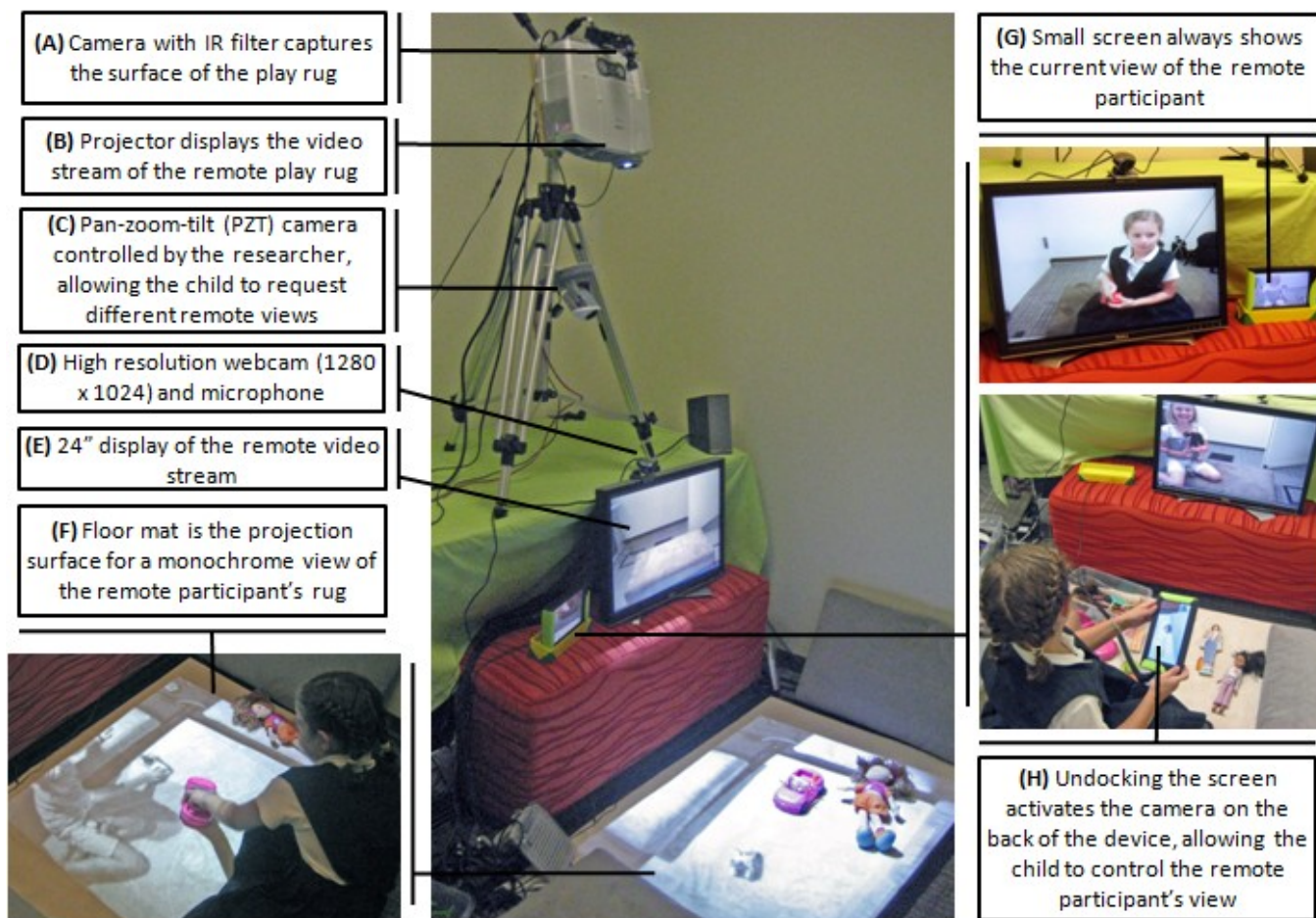
Figure 2. We installed the above setup in two adjacent lab spaces. Different components were activated in each of the four conditions: vanilla (D, E, & G), pan-zoom-tilt (C, E, & G), mobile (D, E, G, & H), and projector rug (A, B, D, E, F, & G).

In the pilot we observed that children wanted to be able to move freely about the space, have a clear view of their partner, and also be able to focus on the toys when appropriate. Though current pan/zoom/tilt cameras may be too complex for children to control while simultaneously attending to their play activity, computer vision may soon be sophisticated enough to accurately predict the ideal area of the room to display. To evaluate the potential success of this future possibility, we used a Wizard of Oz methodology with researchers controlling the PZT cameras (C, in Figure 2) to show what we anticipated to be the most salient view. The heuristic the researcher used was to keep