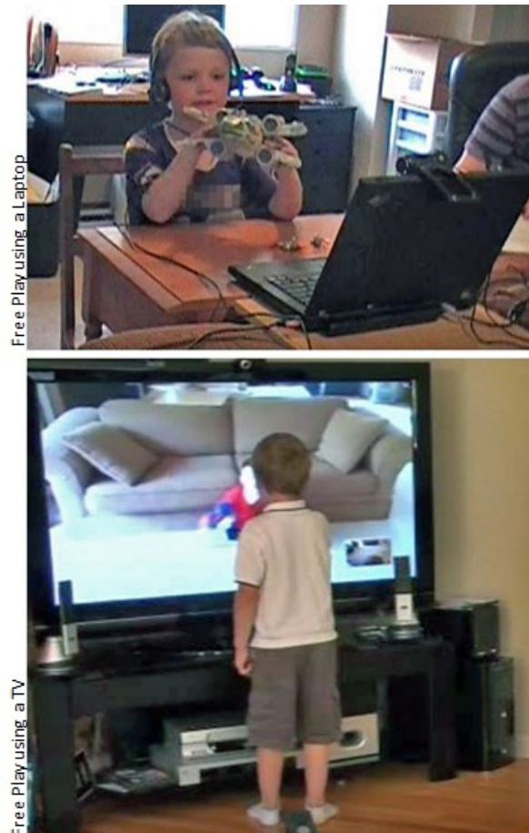
Figure 1. Children attempting to play together via videoconferencing using a laptop (pilot study condition 1) and using a TV (pilot study condition 2).

The individual nature of television and other recent technology-mediated leisure pursuits have been implicated in the decline of the neighborhood and America's social capital [17]. However, a study conducted in the U.S. found the majority of respondents agree that the Internet and mobile telephone have actually brought them closer to their