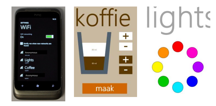
Figure 2. To access a SAWUI, a user chooses the appliance from the WiFi settings screen (left) of their phone. The SAWUI automatically appears with no further user input. We prototyped a SAWUI-controlled coffee machine (middle) and mood light (right). The phone's language setting is used automatically. Cookies store personal settings persistently.

programmatically press the buttons. We used Seeed Studio current sensors on the coffee pump and the milk valve so we could determine when the coffee and milk were pouring.