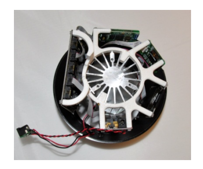
(b) Inside of mood light showing AP module (top) and other prototyping electronics