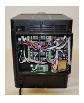
(d) Rear of coffee machine showing prototyping electronics