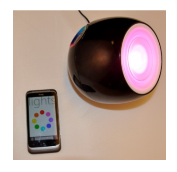
(a) Augmented mood light and a phone showing its UI