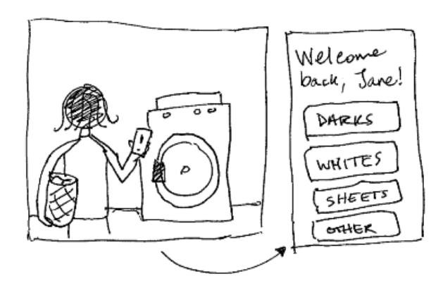
Figure 5. A sketch from P03 showing the SAWUI remembering a user and welcoming her back—with personality!

Participants explained how the more informative feedback discussed in the previous section could potentially come in the form of a playful message—"Go drink your coffee" or "Yay, you're done!" (P04)—or a more pleasant medium, such as P08's decision to replace a washing machine's buzzer with a ringtone. Figure 5 shows a sketch from P03, who capitalized on the smartphone's ability to remember