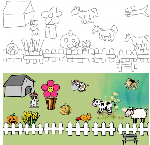
Figure 1: Illustration of Sketch2Cartoon system. The upper image is the input sketch, and the lower one is the resulting cartoon image.

though by leveraging Internet images, iClipart 1 has potential to provide unlimited categories of cartoon objects, the keyword-based inputs are not very natural, especially for children who are too young to read or write.