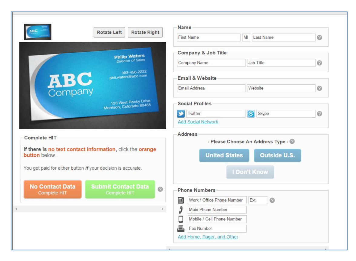
Figure 2: Business Card Digitization