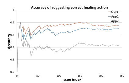
Figure 5. Accuracy of suggesting correct healing actions

highest precision for our approach, App1, and App2, respectively.