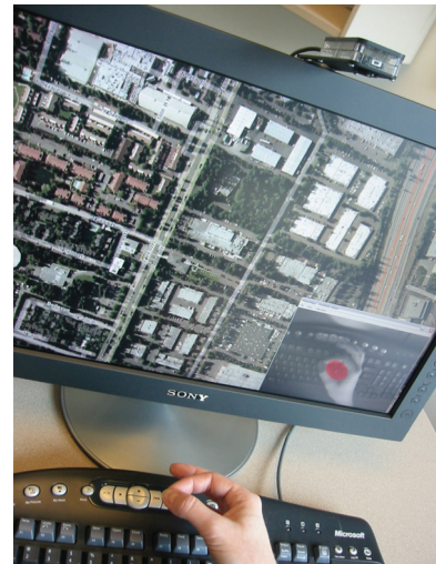
Figure 1: TAFFI prototype includes a USB camera mounted on the top of the display, looking at the user's hand above the keyboard. Here TAFFI is used to navigate Virtual Earth aerial imagery.

Copyright 2006 ACM 1-59593-313-1/06/0010...$5.00.