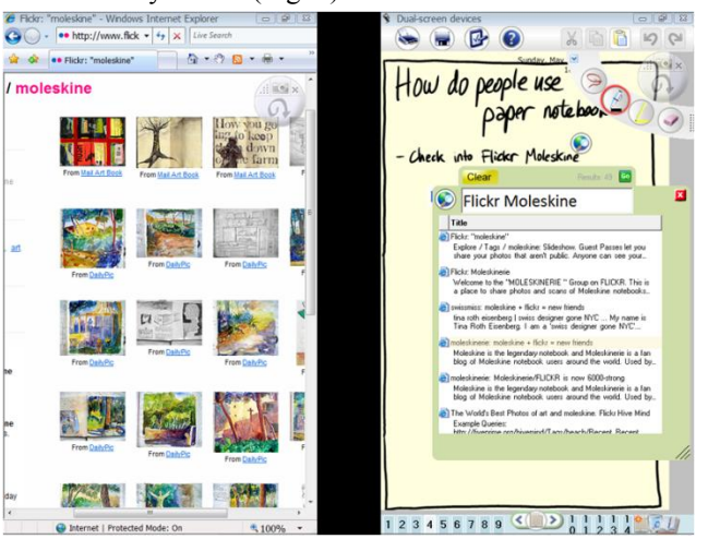
Fig. 6. Bringing up a web page side-by-side with a notebook page.

A key task scenario for the Codex is to support writing notes on one screen in conjunction with reading on the other screen. However, reading and writing themselves are part of a larger task: how does content come to populate the other screen in the first place? The user must hunt for that information, open it, and then gather useful pieces back into their writing [1,7,18,32]. Our software supports this hunter-gatherer workflow. The user starts by writing a phrase on the primary screen. When the user lasso selects the phrase and chooses the Search command, the Codex shows the results. Clicking on a search result opens the web page on the secondary screen (Fig. 6).