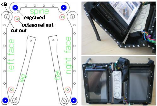
Fig. 4. Left: Exploded view of the detent hinges and support legs. Right : Articulation of the hinges and extension of support legs makes many ergonomic variations possible.

The Codex allows detaching screens, while also providing a hinge with distinct detents to afford facile articulation of the screens (Fig. 4). Each screen is held in place by a base plate, made from the bottom of the "Executive Case" accessory for the OQO Model 02 computer. A firm pull on the screen pops it out of the base, and a firm press pops it back in. The Codex case can still be used as an input device to specify postures even if one or both screens are detached.