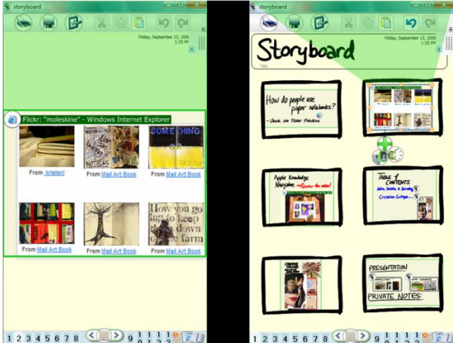
Fig. 8. A storyboard authored using Codex Sidebars.

The software does not currently implement a Back function to undo page link navigation. With two screens a Back feature is not needed to return from a single level of hyperlinking, because the original page with the navigational structure remains visible. With a single screen, navigating to the content occludes the navigational structure, leading to tedious window management tasks such as tabbed browsing or opening links in new windows.