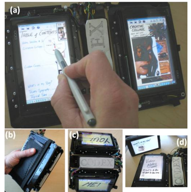
Fig. 1. Codex dual-display tablet. (a) The book posture. (b) Codex folded up for mobility. (c) Face-to-face collaboration. (d) The displays detach.

device) to facilitate lightweight transitions between usage contexts. The folding form-factor offers an inconspicuous, highly mobile kit similar to a small day planner. Detent hinges enable each face to articulate in stable positions, resulting in a rich design space of postures that afford many nuances of private individual work, ambient display, or public collaboration with another user (Fig. 1). Novel interaction techniques support a fluid division of labor between the screens for tasks such as note taking combined with gathering content from reference documents [1,7,18,22,32], navigational structure plus content, private plus public views of information, and other partitions of interface elements and tasks across screens.