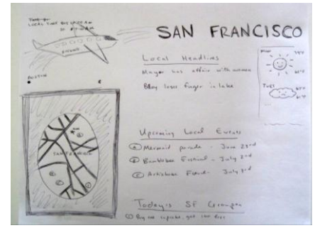
Figure 3: Paper prototype for booking a flight with contextual information during wait periods.

an iterative process. We started with two groups of computer scientists, based on the results of the preliminary questionnaire and the two first participatory design sessions, we reworked the taxonomy and identified professional groups more likely to shed light on the design space. Specifically, we had heard that downloading and editing pictures were common activities that required waiting; therefore we selected a group of photographers. We had also heard that people were interested in managing their time during the wait, so we worked with a group of managers. After starting with programmers we focused on groups with less extensive technological training.