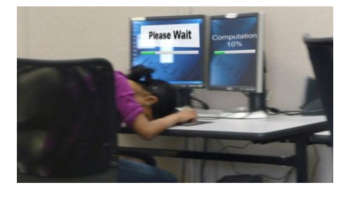
Figure 1: When asked to wait users are often frustrated. Could productive or relaxing activities be proposed?

tasks in a just a few minutes—even seconds—which can be productive or entertaining. We believe progress bars can be augmented with simple functionalities facilitating a switch to a temporary activity, and a smooth return to the primary activity. The remarkable adaptability of computer users means that users develop their own strategies. They may stretch, head for the coffee pot, rest (Figure 1), or stay on the computer and manually switch to a temporary activity such as checking email or Facebook, or reviewing their to-do list. Sometime they may forget to return to the primary task or choose not to return, breaking the flow [1].