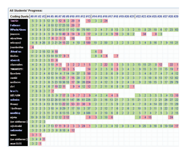
Fig. 7. The status table of the ICSE 2011 coding-duel contest

The ICSE 2011 coding-duel contest received 7,000 Pex4Fun attempts, 450 duels completed, and 28 participants (though likely more, since some did not actually enter the official ICSE 2011 course to play the coding duels designed for the contest). Through initial investigation of the registered participants, we suspect that these 28 participants were mostly graduate students. Among the 28 participants, 4 participants completed all 30 duels, with many more completing all except for the pesky duel #13. Figure 7 shows the status table of the ICSE 2011 coding-duel contest<sup>3</sup>. The first column of the table shows the nicknames of the participants. Columns 2-31 correspond to the 30 coding duels designed for the contest, with the same color coding as described in Section VIII.