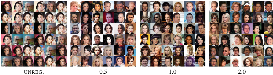
Figure 3: Annealed Regularization. CelebA samples generated by (un)regularized ResNet GANs. The initial level of regularization \gamma_0 is shown below each batch of images. \gamma_0 was exponentially annealed as described in Algorithm 1. The regularized GANs can be trained essentially indefinitely without collapse, the superior quality is again evident. Samples were produced after 100k generator iterations.