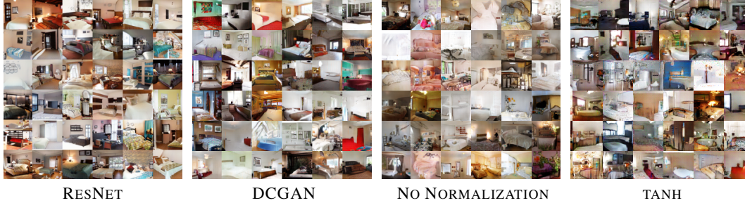
Figure 2: Stability across various architectures: ResNet, DCGAN, DCGAN without normalization and DCGAN with tanh activations (details in the Appendix). All samples were generated from regularized GANs with exponentially annealed \gamma_0 = 2.0 (and alternative generator loss) as described in Algorithm 1. Samples were produced after 200k generator iterations on the LSUN dataset (see also Fig. 8 for a full-resolution image of the ResNet GAN). Samples for the unregularized architectures can be found in the Appendix.