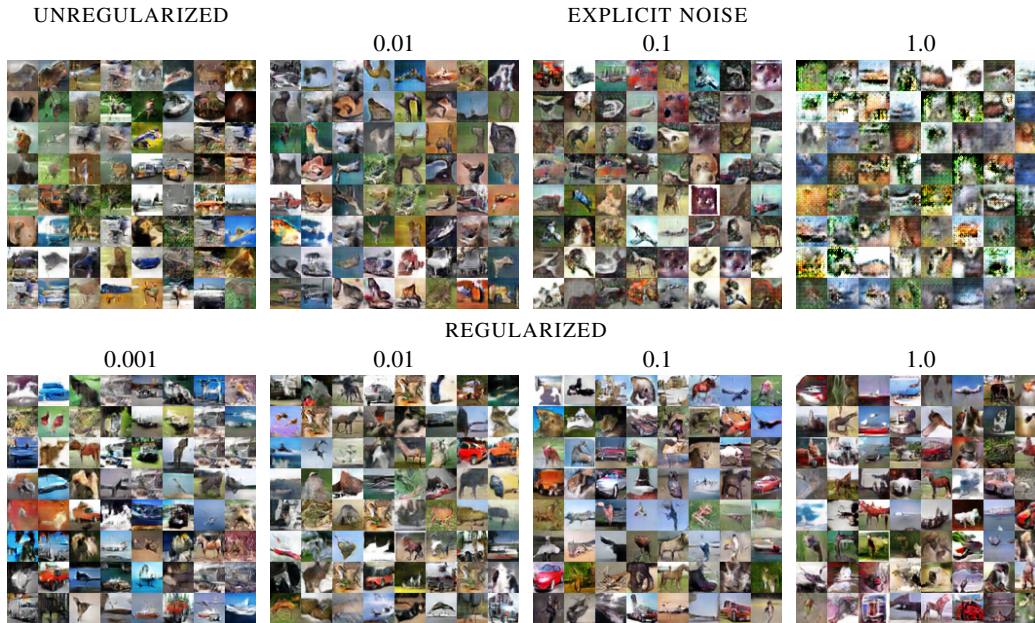
Figure 4: CIFAR-10 samples generated by (un)regularized DCGANs (with alternative generator loss), as well as by training a DCGAN with explicitly added noise (noise-to-signal ratio 4). The level of regularization or noise \gamma is shown above each batch of images. The regularizer stabilizes across a broad range of noise levels and manages to produce images of higher quality than the unregularized variants. Samples were produced after 50 training epochs.