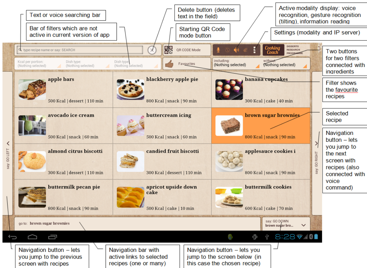
Figure 2: Multimodal Cooking Coach graphical user interface.

After the user names one or several missing ingredients, the system goes back to the recipe identification, and sends the same request forbidding these ingredients. The system remembers as well the number of people. Once the recipe has been validated, the system reads the steps one by one, with the possibility for the user to navigate through the steps : go further, repeat the current step and go back to the previous one.