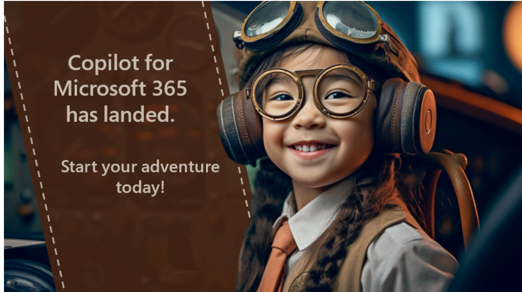
Image Alt text: A smiling young girl wearing a scouting uniform and vintage aviator goggles and headgear, and, "Copilot for Microsoft 365 has landed. Start your adventure today!"