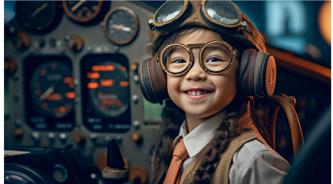
Image Alt text: A smiling young girl wearing a scouting uniform and vintage aviator goggles and headgear, and, "Explore Copilot experiences available now! Imagine the adventures that await you..."