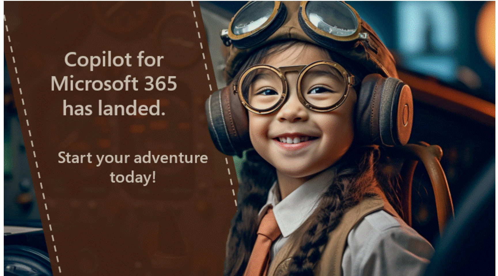
Image Alt text: A smiling young girl wearing a scouting uniform and vintage aviator goggles and headgear, and "Copilot for Microsoft 365 has landed! Start your adventure by exploring all available Copilot for M365 experiences!"