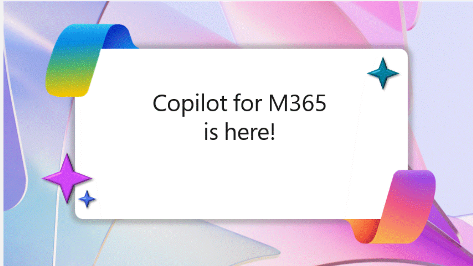
Image Alt text: Animated elements including sparkle icons and the Copilot logo on a moving, pastel background, and, “Copilot for Microsoft 365 is here. So now what? Celebrate! That’s what! Simply look for the Copilot icon in your favorite M365 app to get started. Show them what you can do. Go fly!”